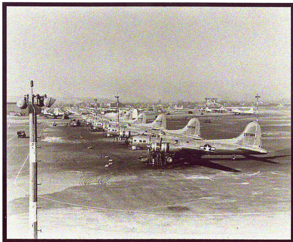
B-17 Fortresses lined up outside Boeing Seattle plant. These G model Flying Fortresses just off the production line in Seattle await delivery to the combat modification center in Kansas. Foreground a/c tail number is 297384, then 298385, 297386 and so on. The very last B-17 rolled off the production line on April 13, 1945.