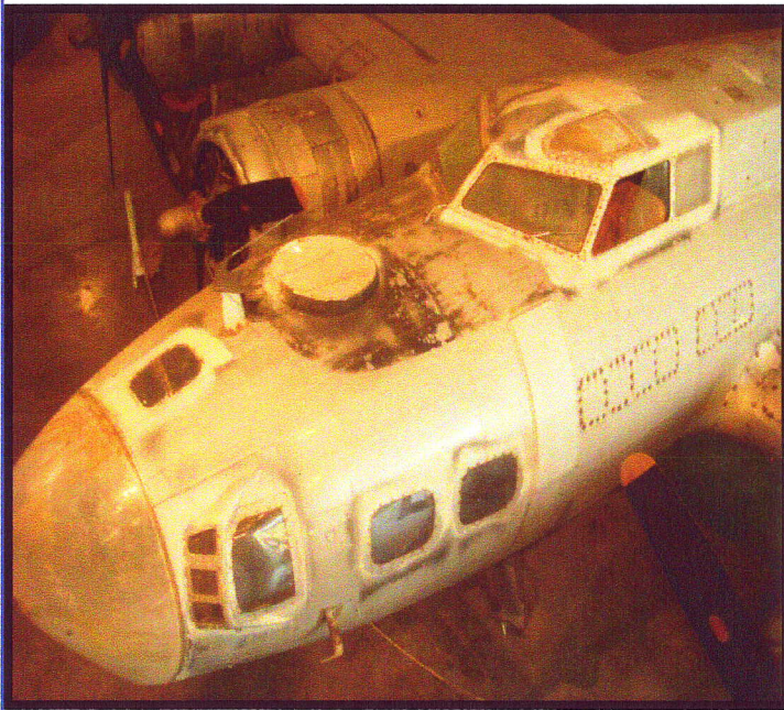
January 2009, arrival of the B-17 in the Combat Gallery at the Mighty Eighth Air Force Museum.

This week mostly involved planning for upcoming events. The Museum is sponsoring a pot-luck dinner for active volunteers and their families on Wednesday, November 18 to include pictures of the kids with the “City of Savannah”.