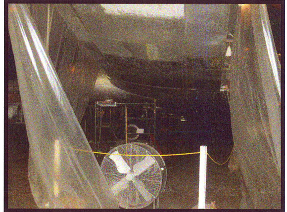
Hopefully the ColdJet will aid in the tedious job of cleaning the undersides of the wings